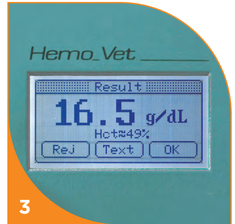
3 Result appears in 25 - 60 seconds.