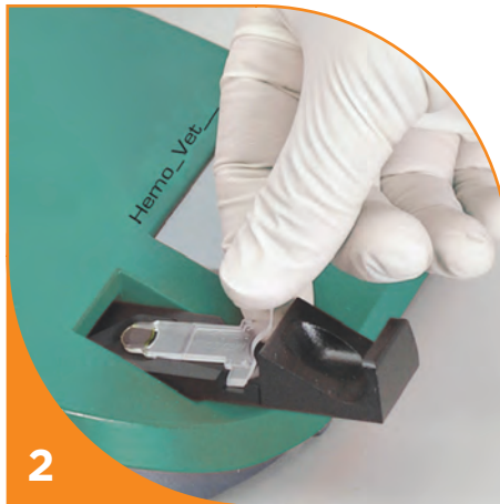
2 Put microcuvette into analyser.